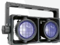
CLUSTER B2 FC