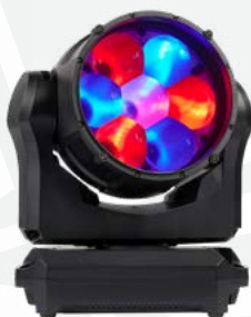
MAC Aura XIP