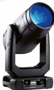
iForte LTX/LTX FS