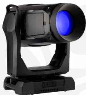
MAC Viper XIP