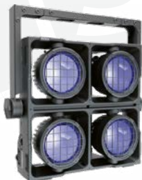
CLUSTER B4 FC