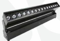
Wild Bar 16