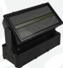
JDC Burst 1